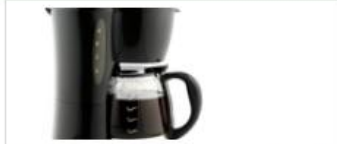
Turn Off Coffee Maker After Brewing