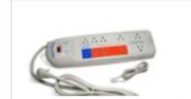
Use an Advanced Power Strip

Pledge to save up to $250 annually by using less energy.