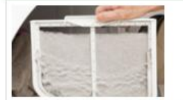
Clean Your Dryer's Lint Filter