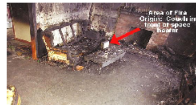
Space Heaters Cause Fires