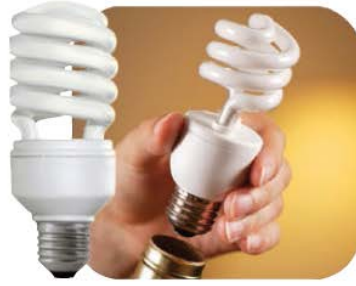
Compact Fluorescent Light Bulbs