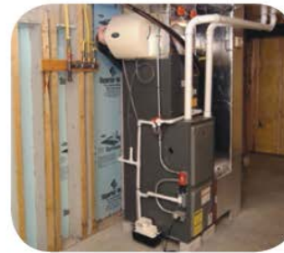
Furnace or Boiler Tune-up