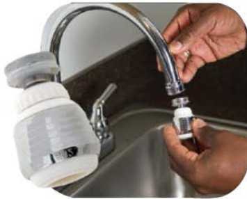
Water-saving Faucet Aerator