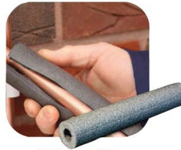
Water Heater Pipe Wrap